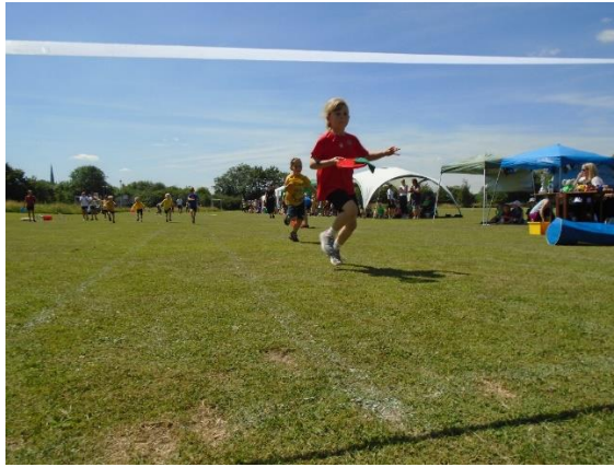
Class 2 – Ahlberg

Ahlbergs have been learning all about World War 1. We have traced a soldier from his work on a farm in Braunston to the front line in France in 1916. The children have been fascinated to learn about the conditions in the trenches and what life was like for a soldier during this time. We are also learning about what life was like in Braunston between 1914 - 1918 and we have all really enjoyed looking at old photographs of the village.