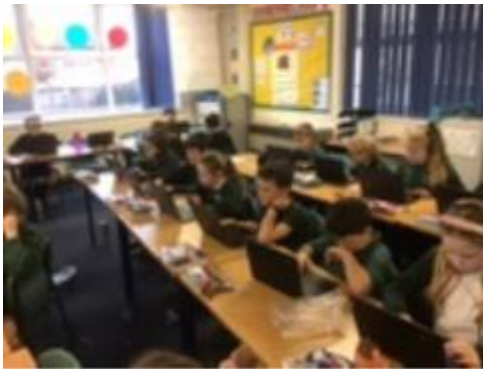
Practising our maths skills

Year 5 have started the term with lots of exciting learning opportunities ahead. We are enjoying learning about the Amazon Rainforest and incorporating this into our English and our reading detective text, 'The Vanishing Rainforest'. In DT we will be looking at a project on pop up books based on the Amazon Rainforest. If you have any pop up books at home, it would be great to look at them in school. We are also looking forward to a maths enrichment day organised by PDET. This will be held at The Frontier Centre, Irthlingborough, so we will get a look at where we will be heading on our residential later in the year. In maths, this week, we are focusing on multiplication by multiplying 2 digits by 2 digits. We will be moving onto division soon. We have realised that we need to keep practising our times tables to help us with these. In RE, we have started to look at the beliefs of Jewish people. We are looking forward to having a visitor who will give us a lot more information and we will share any photos with you.