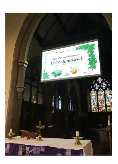
Class 1 - Donaldson

Our science topic this term is all about the human body. We carefully observed our faces and labelled our main body parts. We explored our senses; touch, taste, smell, sight and sound. We walked around the school grounds, using our senses to identify signs of Autumn. We had a carousel of activities to use and test our senses. We used blindfolds to lose our sense of sight but using our sense of touch we were able to guess given objects. We also used our sense of touch to match the fabrics to the correct pair. We had a listening station and had to guess what the noises we heard were. We liked the sound of the fireworks the best! We are looking forward to testing our senses of smell and taste.